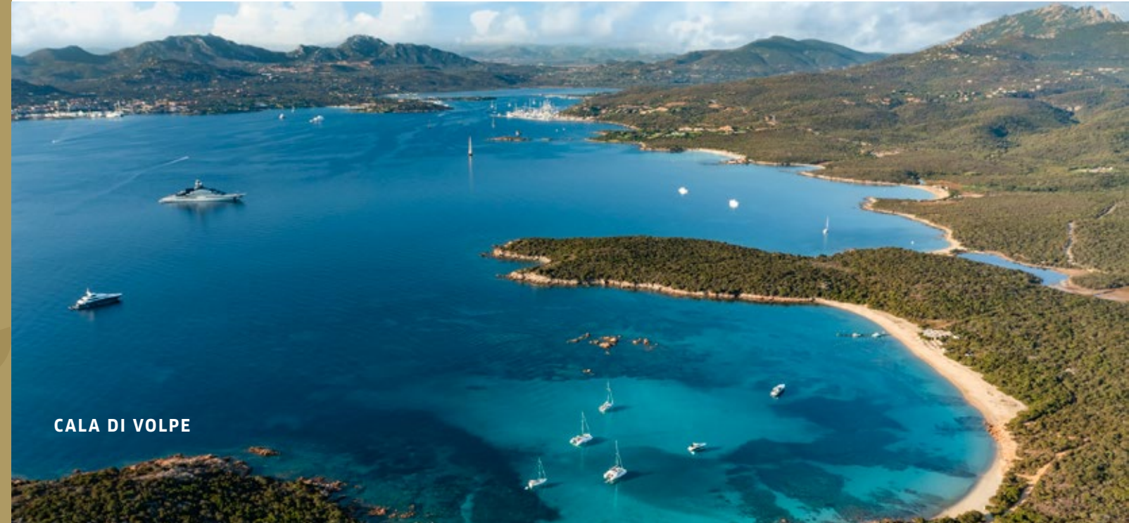
CALA DI VOLPE

WE CAN FASHION A TAILOR-MADE PROGRAMME TO SUIT YOUR TASTES